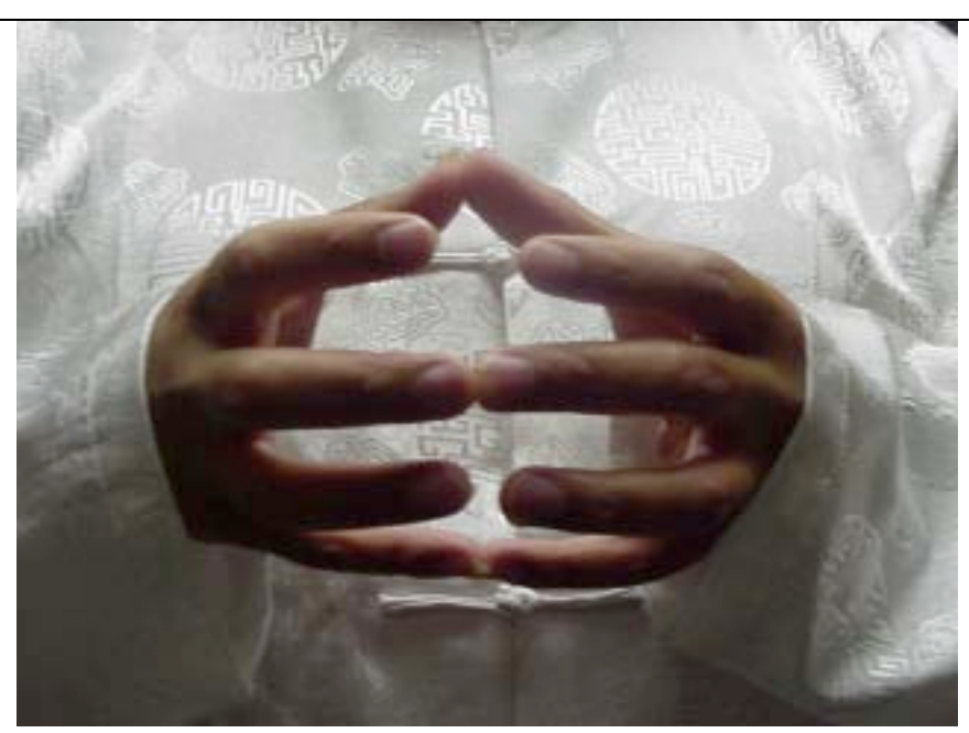
Figure 1. Pure Yang Mudra

By carefully examining the formation of the Pure Yang Mudra, we can see that it has deep roots in the Book of Changes . The Book of Changes contains 64 hexagrams. A hexagram is constructed of six lines, three on the top and three on the bottom. Each set of three lines is called a trigram. To make a mudra the fingers come together to form the two trigrams that make up the hexagram.